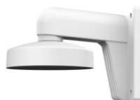
DS-1273ZJ-135 Wall mount