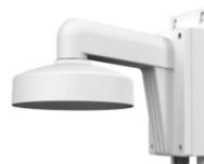
DS-1273ZJ-135B Wall mount with Junction box