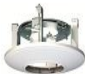
DS-1227ZJ In-ceiling mount