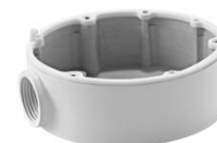
DS-1280ZJ-DM21 Junction box