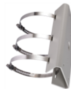
DS-1275ZJ-SUS Vertical Pole Mount