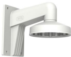
DS-1273ZJ-DM32 Wall Mount