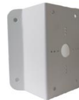
DS-1276ZJ-SUS Corner Mount