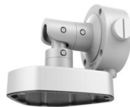
DS-1283ZJ Wall Mount (3-axis Adjustment)