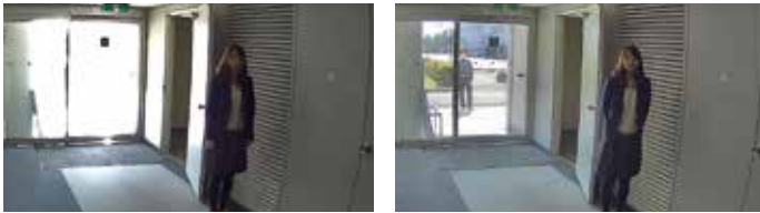
OFF ON Actual images